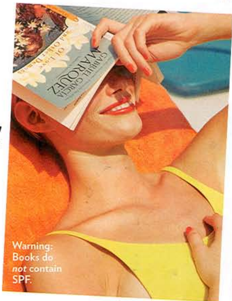
Warning: Books do not contain SPF.

We're all for smart, funny, stylish magazines (ahem), but those book thingies are great too. Our picks for the reads everyone is going to be talking about poolside.